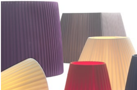
Ponge - Crushed - Sie - Bel - Egipto Ribbons